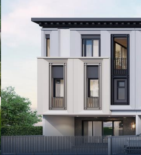
M VENUË RAMA 3 - SUKSAWAT 62