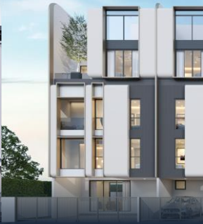
MAVICH Sathupradit - Rama 3