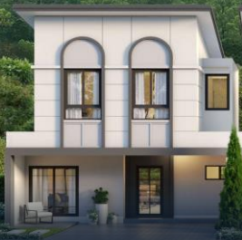
MAISON HILL Sukhumvit - Sriracha